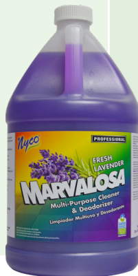
MARVALOSA Fresh Lavender NL269-G4