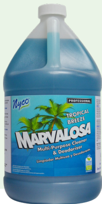
MARVALOSA Tropical Breeze NL276-G4