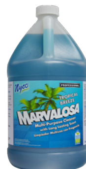
NL276-G4 Multi-Purpose Cleaner