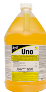
NL760-G4 Cleaner/Deodorizer, Disinfectant, Fungicide, Mildewstat, Virucide