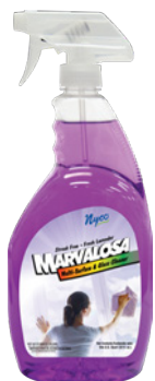
NL906-QPS9 Multi-Surface & Glass Cleaner