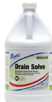
NL013-G4 Nonfuming Liquid Drain Opener