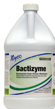
NL044-G4 Bioenzymatic Drain Cleaner Maintainer

Septic systems: Add 8 oz. per 1000 gallon capacity.