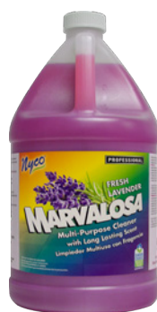
NL269-G4 Multi-Purpose Cleaner