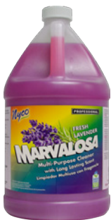
NL269-G4 Multi-Purpose Cleaner