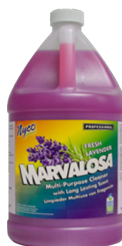
NL269-G4 Multi-Purpose Cleaner