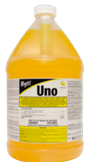
NL760-G4 Cleaner/Deodorizer, Disinfectant, Fungicide, Mildewstat, Virucide