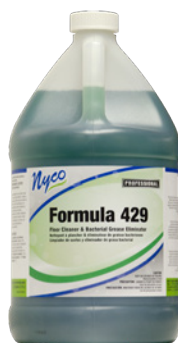
NL429-G4 Floor Cleaner & Bacterial Grease Eliminator