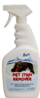
NL90390-953206 Pet Odor & Stain Eliminator