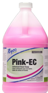
NL358-G4 Pink Lotonized Hand Soap