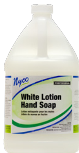
NL391-G4 White Lotonized Hand Soap