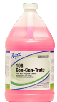
NL108-G4 Floor & All Purpose Cleaner