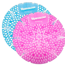
BD-269-10 Fresh Lavender Urinal Screen BD-276-10 Tropical Breeze Urinal Screen