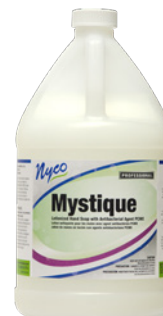
NL591-G4 Lotonized Hand Soap with Antibacterial Agent PCMX