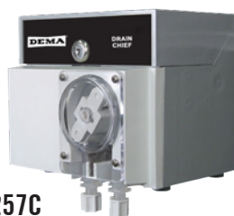
DSP-257C Drain Chief