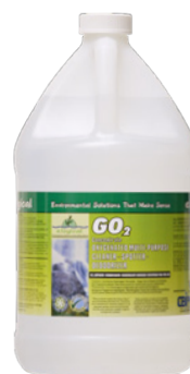
GS005-G4 Oxygenated Multi-Purpose Cleaner & Spotter