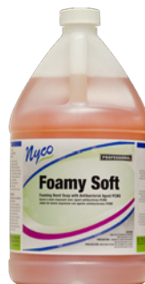
NL556-G4 Foaming Hand Soap with Antibacterial Agent PCMX