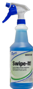
NL212-Q12 Spray & Wipe Cleaner Degreaser