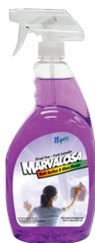
NL906-QPS9 Multi-Surface & Glass Cleaner