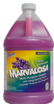
NL269-G4 Multi-Purpose Cleaner