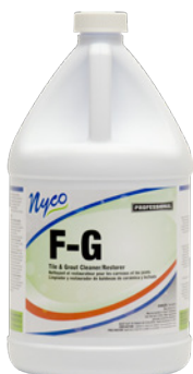
NL864-G4 Tile & Grout Cleaner/Restorer