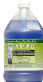
CB012-G4 One-Step Disinfectant