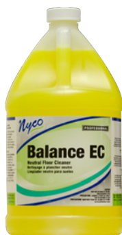
NL158-G4 Neutral Floor Cleaner