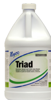
NL507-G4 Extraction, Bonnet & Traffic Lane Cleaner