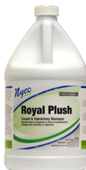
NL505-G4 Carpet & Upholstery Shampoo