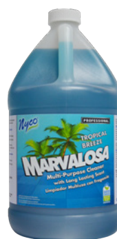
NL276-G4 Multi-Purpose Cleaner